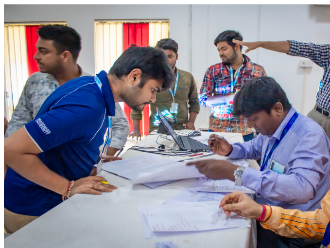
Students registering for blood donation