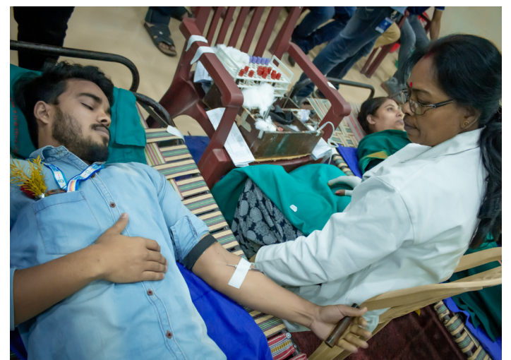
Students donating blood

Nowadays there is so much violence, so much bloodshed. Frequent riots are destroying humanity. On the other hand, initiatives like a blood donation is a helping hand to humanity.