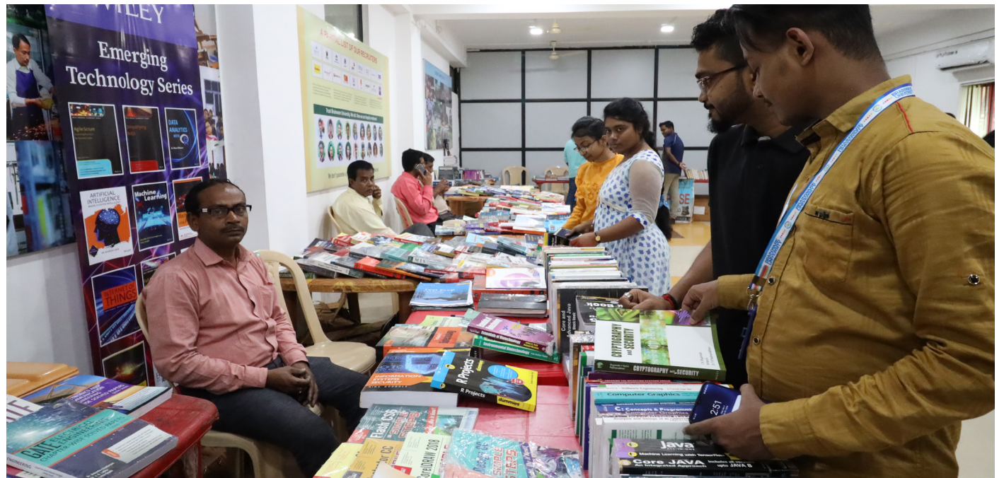
Students at Brainware University's Book Fair

Wonderful news for the bibliophile and the students who love to write. Along with the book fair, the Department of the Library took a step forward with an unique idea of ‘e-journal’ named ‘Brainwave’.