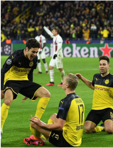
Erling Haaland after scoring a brace

The UEFA champions league is an annual club Football competition. It is organised by the Union of European Football Association (UEFA). It is one of the most prestigious club competitions in the world. This competition began in 1955. This year the first leg, round of 16 happened last week. The results of Week-1 were:-